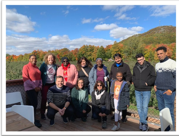
Staff team and some program participants at our apple-picking event. October 2022.

Third, and as mentioned above, the sponsorship program has been busy with increased arrivals compared to recent years. With costs of living rising, we hope to increase our support to sponsored persons as they adjust to life in a new country. 160 individuals are still waiting to arrive in Canada, and we are working on a new round of applications to submit to the provincial government. We share our expertise with others, as we have been involved in leading training sessions on submitting refugee sponsorship applications for the general public.