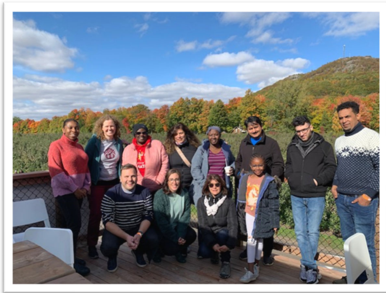
Staff team and some program participants at our apple-picking event. October 2022.

Third, and as mentioned above, the sponsorship program has been busy with increased arrivals compared to recent years. With costs of living rising, we hope to increase our support to sponsored persons as they adjust to life in a new country. 160 individuals are still waiting to arrive in Canada, and we are working on a new round of applications to submit to the provincial government. We share our expertise with others, as we have been involved in leading training sessions on submitting refugee sponsorship applications for the general public.